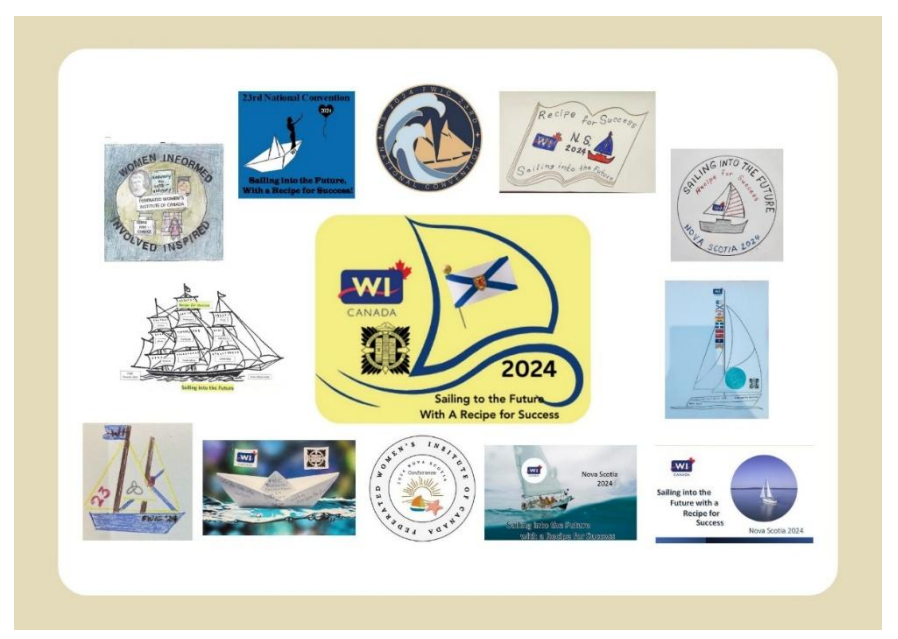
Page 2 of 23

"Each time a woman stands up for herself she stands up for all women." – Maya Angelou