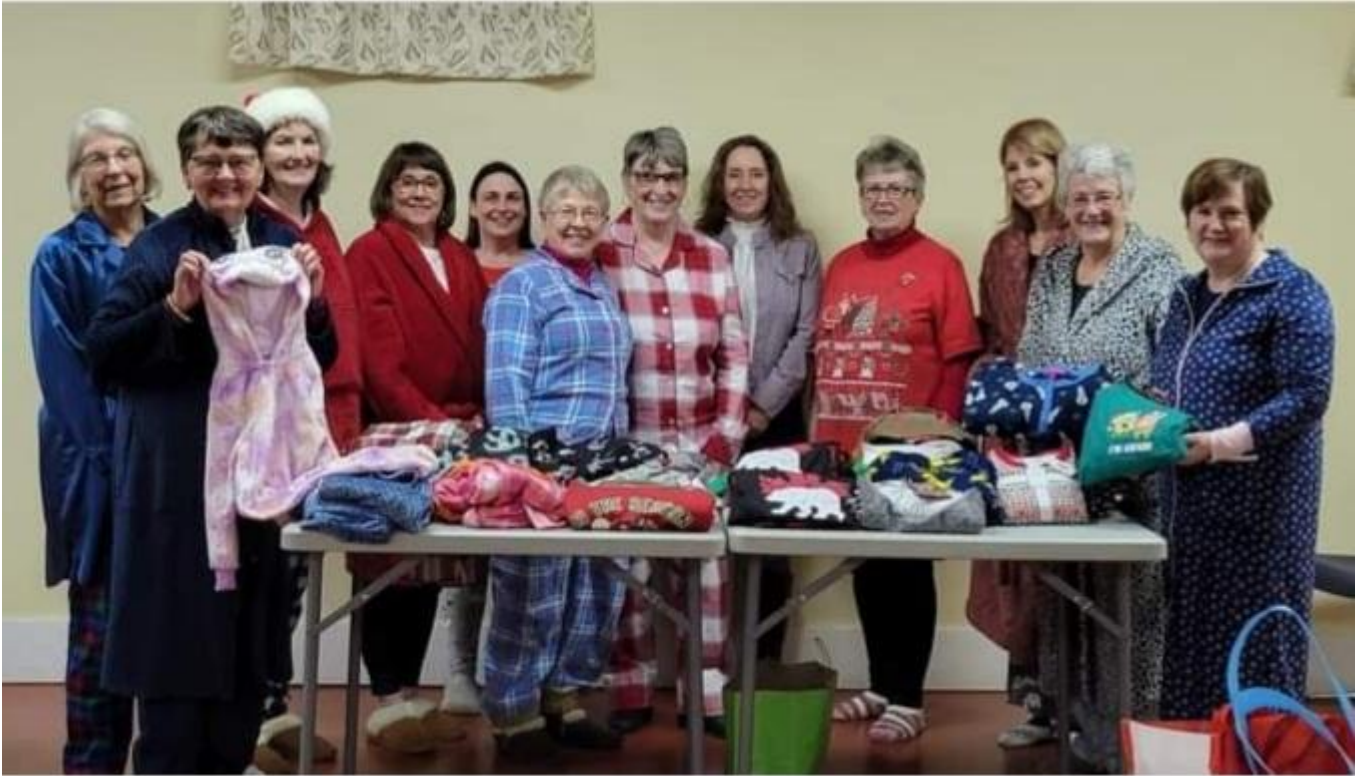
The Lyon's Brook and Area WI had their PJ Potluck meeting. Members enjoyed a glass of cheer before having a delicious meal. Donations of sleepwear were collected for Tearman House women's shelter.